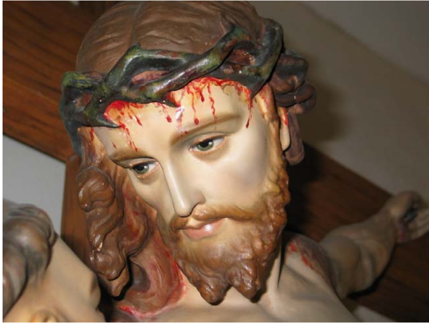
Gaze at the Mirror