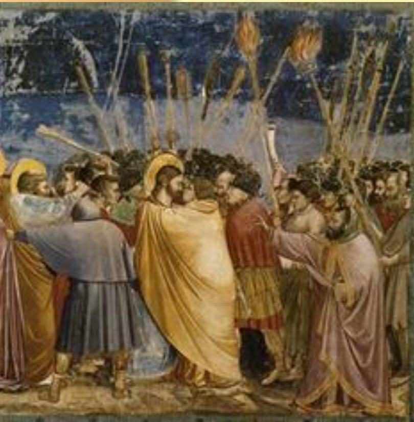
The Kiss of Judas

We should be careful not to over-estimate our personal righteousness