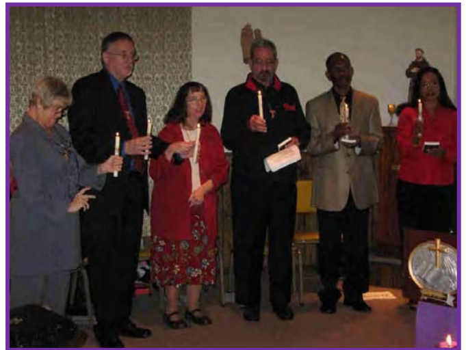
New Members of St. Francis of Assisi Fraternity