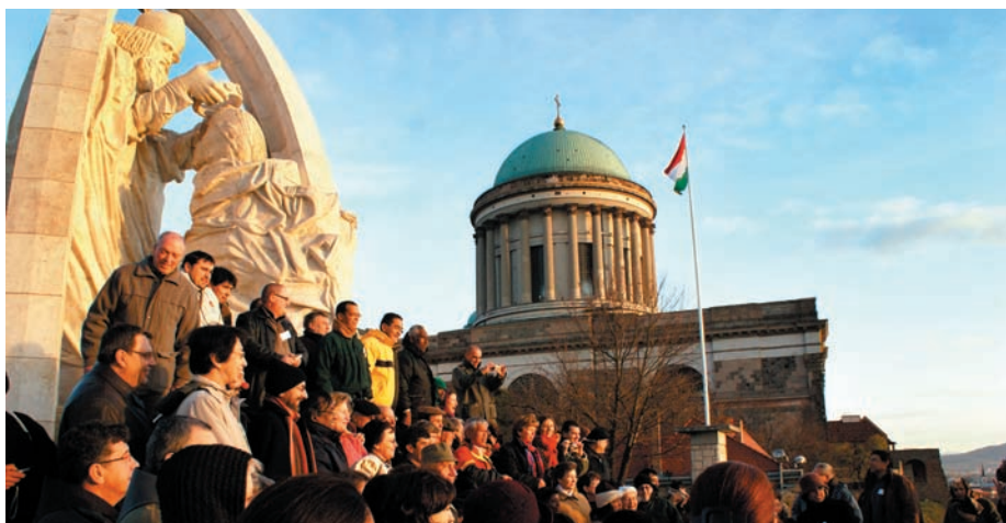
Chapter attendees pose for photos at the statue of St. Stephen near Esztergon Cathedral (background).