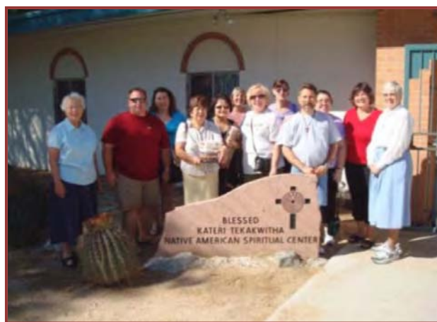
St. Clare Fraternity members with the Sisters on each end.

When we had finally finished this sometimes overwhelming task, we were able to smile and say...this is perfect joy!