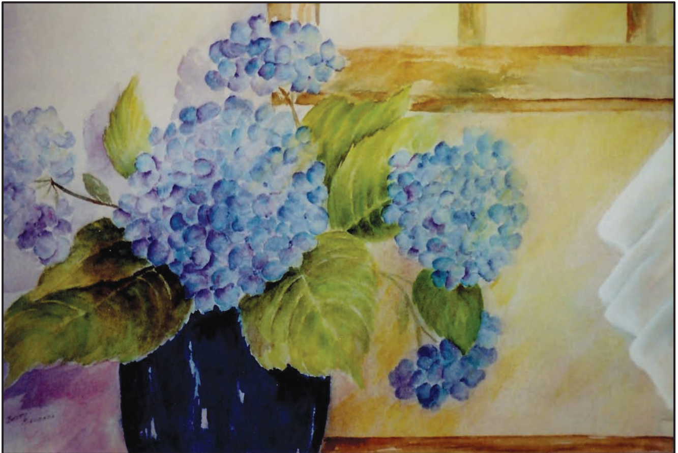
Watercolor by Betty Misuraca

Publication of the National Fraternity of the Secular Franciscan Order in the United States Spring 2009 - Issue 62