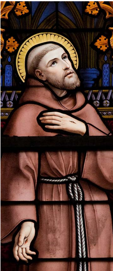
St. Francis -- stained glass in the cathedral of Brussels, created in 1866.

As followers of Francis and Clare, their prayer life inspires us to a deeper relationship with God. But how did they open their hearts and souls? How did they converse with the Almighty, All powerful Lord of all?