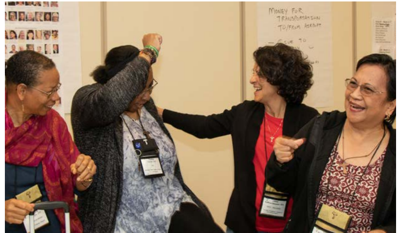
The chapter erupted into song and dance when the YouFra team began a presentation with blaring funky music.

“They seemed to have it all,” noted one attendee as she was leaving the OFS National Chapter in Corpus Christi, Texas.