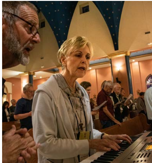
Daily liturgies and ongoing formation spurred truly spiritual moments.