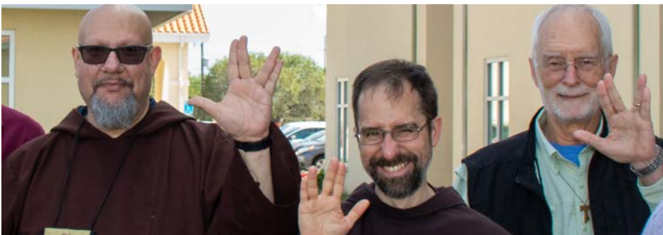
A Star Trek/Vulcan message to the universe: Live long and prosper...in body and spirit.