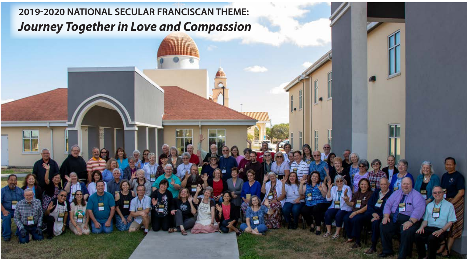
2019-2020 NATIONAL SECULAR FRANCISCAN THEME: Journey Together in Love and Compassion