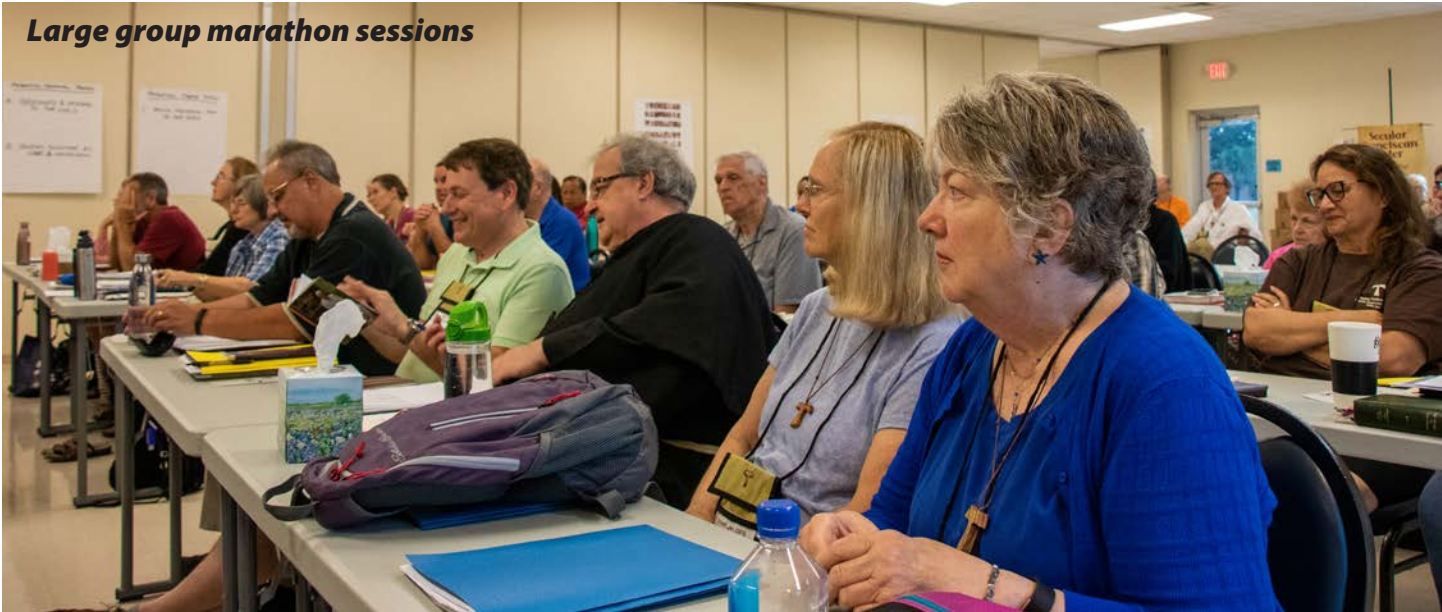
Large group marathon sessions

Continued from previous page. ing marathons opened the door for the Order to tackle the challenges and opportunities confronting seculars now and in the future.