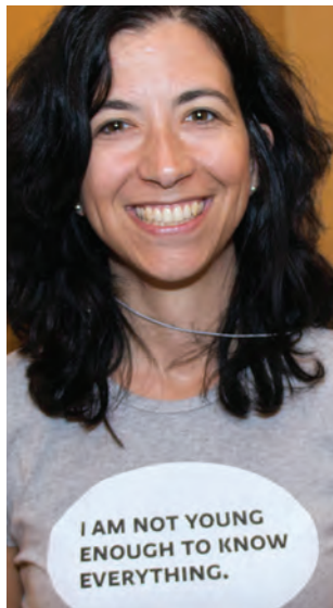
Filling "blessing bags" for the homeless.